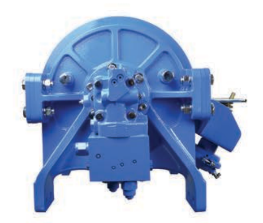
Dual Drag Brakes